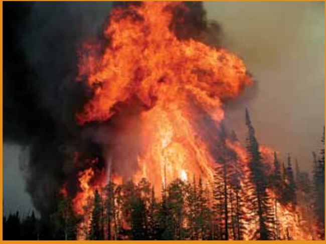
Figure 3: Burning embers can be carried long distances by wind. Embers ignite structures when they land in gaps, crevices and other combustible places around the home.

Heavier fuels, such as brush and trees, produce a more intense fire than light fuels, such as grass. However, grass-fueled fires travel much faster than heavy-fueled fires. Some heavier surface fuels, such as logs and wood chips, are potentially hazardous heavy fuels and also should be addressed.