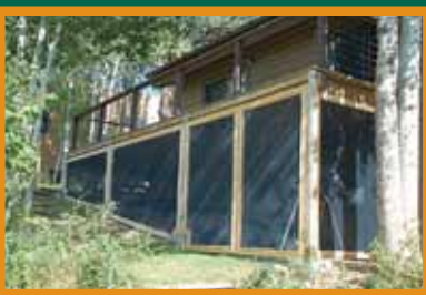
Figure 16: Enclosing decks with metal screens can prevent embers from igniting a house.