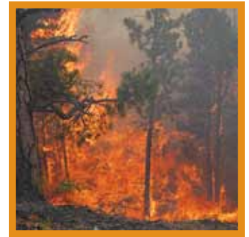
Figure 4: Ladder fuels are shrubs and low branches that allow a wildfire to climb from the ground into the tree canopy.

An intense fire burning in surface fuels can transition into the upper portion of the tree canopies and become a crown fire. Crown fires are dangerous because they are very intense and can burn large areas. Crown fire hazard can be reduced by thinning trees to decrease crown fuels, reducing surface fuels under the remaining trees, and eliminating vertical fuel continuity from the surface into the crowns. Specific recommendations are provided in the Defensible Space Management Zones, pages 5-8.