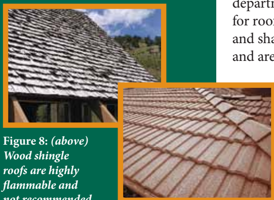
Figure 8: (above) Wood shingle roofs are highly flammable and not recommended.

This guide provides only basic information about structural ignitability. For more information on fire-resistant building designs and materials, refer to the CSFS FireWise Construction: Site Design and Building Materials publication at www.csfs.colostate.edu .