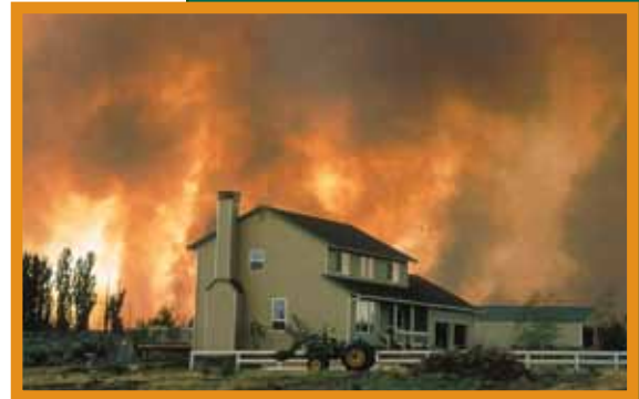
Figure 1: Firefighters will do their best to protect homes, but ultimately it is the homeowner's responsibility to plan ahead and take actions to reduce fire hazards around structures.

In this guide, you'll read about steps you can take to protect your property from wildfire. These steps focus on beginning work closest to your house and moving outward. Also, remember that keeping your home safe is not a one-time effort – it requires ongoing maintenance. It may be necessary to perform some actions, such as removing pine needles from gutters and mowing grasses and weeds several times a year, while other actions may only need to be addressed once a year. While