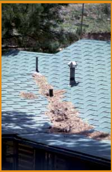
Figure 15: Clearing pine needles and other debris from the roof and gutters is an easy task that should be done at least once a year.