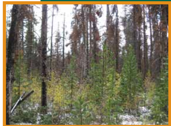
Figure 23: A young lodgepole pine stand. Thinning lodgepole pines early on in their lives will help reduce the wildfire hazard in the future.