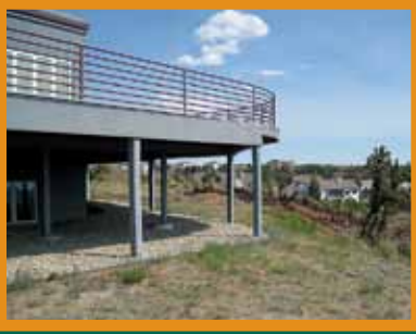
Figure 14: This homeowner worked hard to create a defensible space around the home. Notice that all fuel has been removed within the first 5 feet of the home, which survived the Waldo Canyon Fire in the summer of 2012.

Zone 2 is an area of fuels reduction designed to diminish the intensity of a fire approaching your home. The width of Zone 2 depends on the slope of the ground where the structure is built. Typically, the defensible space in Zone 2 should extend at least 100 feet from all structures. If this distance stretches beyond your property lines, try to work with the adjoining property owners to complete an appropriate defensible space.