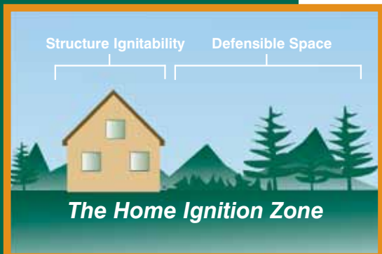
Figure 7: Addressing both components of the Home Ignition Zone will provide the best protection for your home.

Two factors have emerged as the primary determinants of a home's ability to survive a wildfire – the quality of the defensible space and a structure's ignitability. Together, these two factors create a concept called the Home Ignition Zone (HIZ) , which includes the structure and the space immediately surrounding the structure. To protect a home from wildfire, the primary goal is to reduce or eliminate fuels and ignition sources within the HIZ.