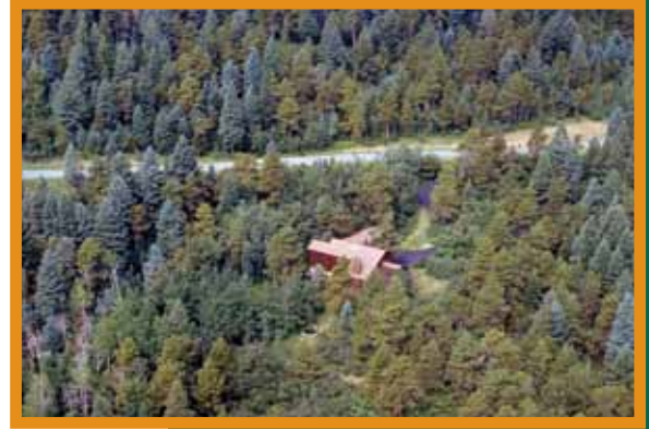
Figure 28: This house has a high risk of burning during an approaching wildfire. Modifying the fuels around a home is critical to reduce the risk of losing structures during a wildfire.