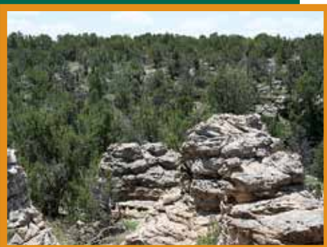
Figure 24: Piñon-juniper forests are often composed of continuous fuels. Creating clumps of trees with large spaces in between clumps will break up the continuity.

The defensible space guidelines in this quick guide are predominantly for ponderosa pine and mixed-conifer forests. These guidelines will vary with other forest types.