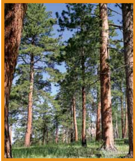
Figure 20: This ponderosa pine forest has been thinned, which will not only help reduce the wildfire hazard, but also increase tree health and vigor.