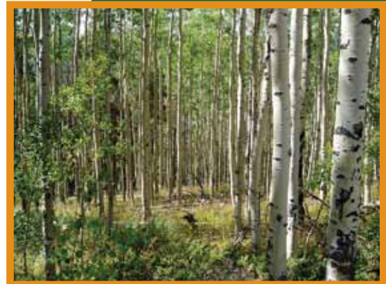
Figure 22: Mature aspen stands can contain many young conifers, dead trees and other organic debris. This can become a fire hazard.