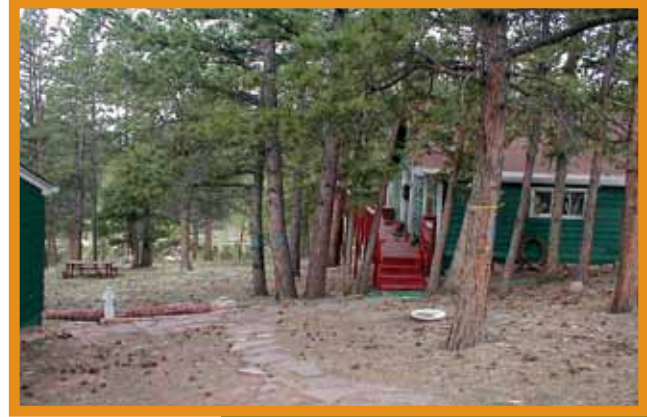
Figure 11: Homesite before defensible space.

Zone 3 is the area farthest from the home. It extends from the edge of Zone 2 to your property boundaries.