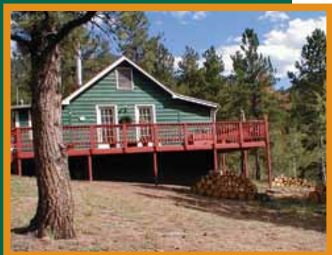
Figure 10: Decks, exterior walls and windows are important areas to examine when addressing structure ignitability.