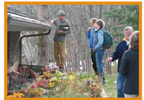
Figure 27: Sharing information and working with your neighbors and community will give your home and surrounding areas a better chance of surviving a wildfire.