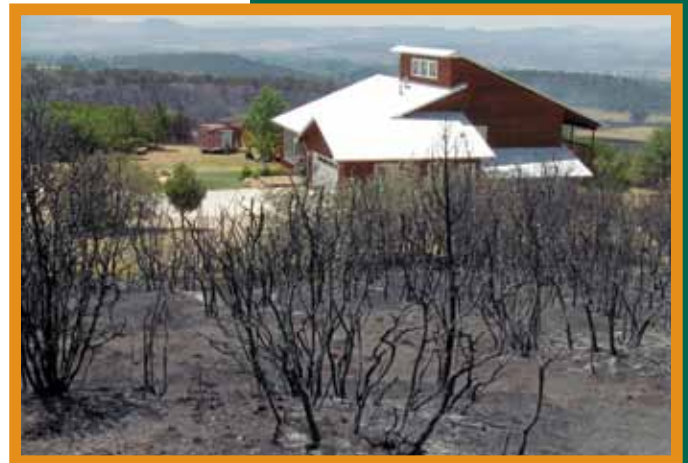
Figure 30: Firefighters were able to save this house during the 2012 Weber Fire because the homeowners had a good defensible space.