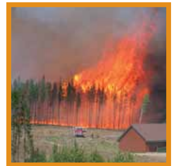
Figure 6: Tree canopies offer fuel for intense crown fires.