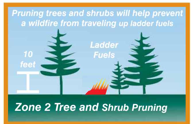
Figure 18: Pruning trees will help prevent a wildfire from climbing from the ground to the tree crowns.