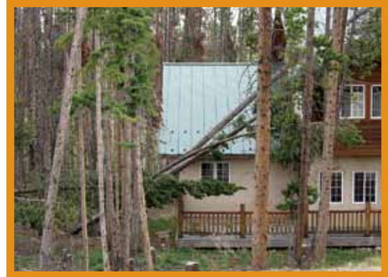
Figure 21: During high winds, these lodgepole pine trees fell onto the house. Lodgepole pine is highly susceptible to windthrow.

To ensure a positive response to thinning throughout the life of a lodgepole pine stand, trees must be thinned early in their lives – no later than 20 to 30 years after germination. Thinning lodgepole pine forests to achieve low densities can best be