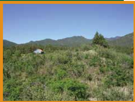
Figure 25: Gambel oak needs to be treated in a defensible space at least every 5-7 years because of its vigorous growing habits.

accomplished by beginning when trees are small saplings, and maintaining those densities through time as the trees mature.