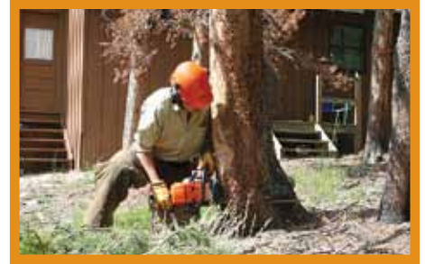
Figure 26: Keeping the forest properly thinned and pruned in a defensible space will reduce the chances of a home burning during a wildfire.