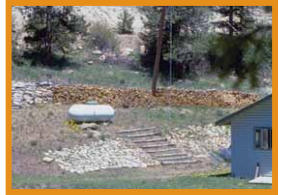
Figure 19: Keep firewood, propane tanks and natural gas meters at least 30 feet away from structures.