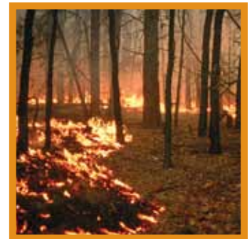
Figure 5: Surface fuels include logs, branches, wood chips, pine needles, duff and grasses.