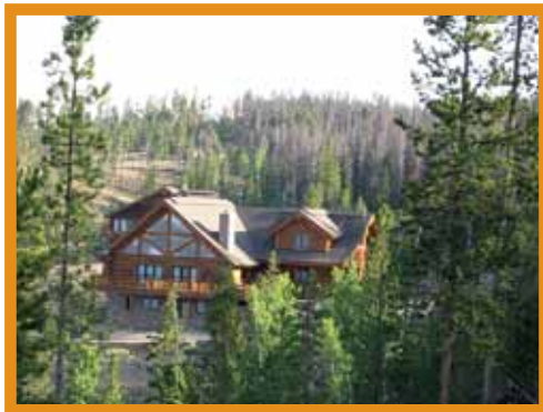
Figure 2: Colorado's grasslands, shrublands, foothills and mountains all have areas in the wildland-urban interface where human development meets wildland vegetative fuels.

subdivisions and communities, all landowners must work together to reduce fire hazards within and adjacent to communities. This includes treating individual home sites and common areas within communities, and creating fuelbreaks within and adjoining the community where feasible. This document will focus on actions individual landowners can take to reduce wildfire hazards on their property. For additional information on broader community protection, go to www.csfs.colostate.edu .