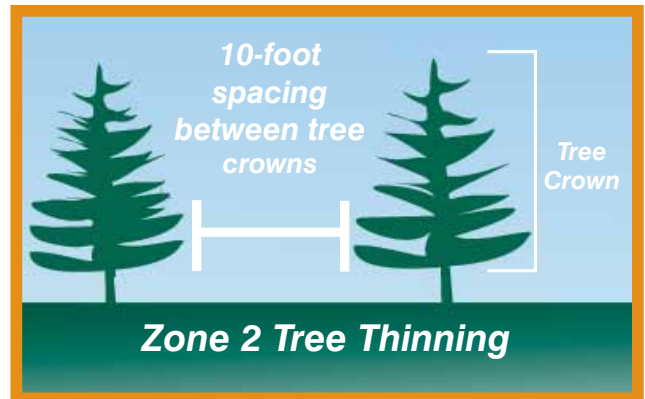
Figure 17: In Zone 2, make sure there is at least a 10-foot spacing between tree crowns.