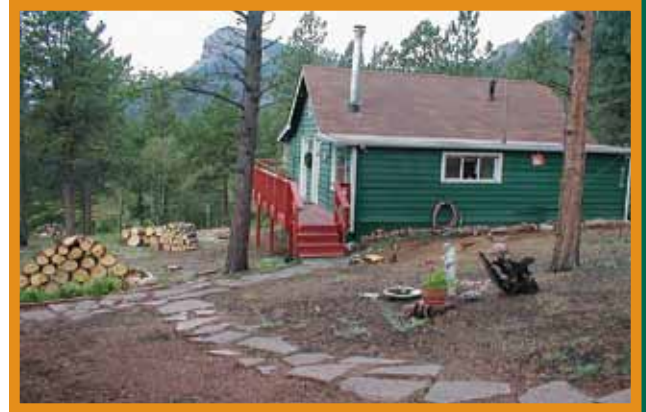
Figure 12: Homesite after creating a defensible space.