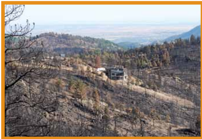
Figure 29: This house survived the Fourmile Canyon Fire in 2010.